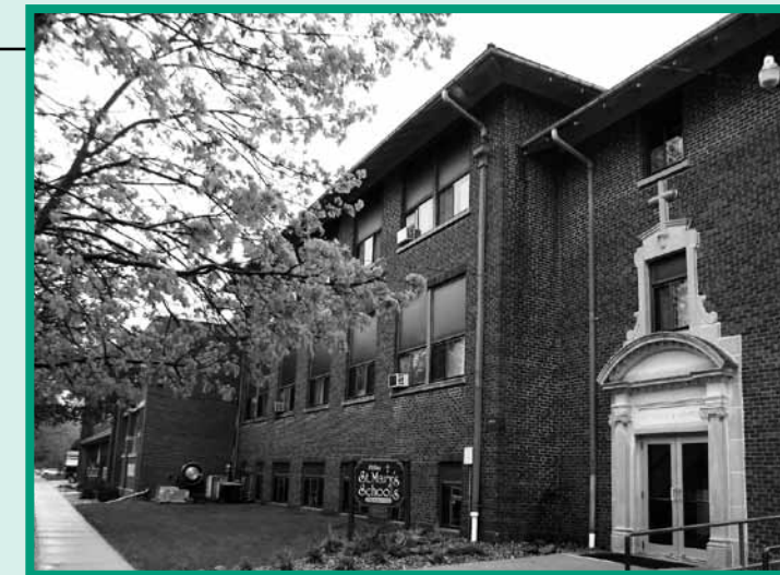
St. Mary School in Storm Lake, Iowa

A new brick school building housing grades 1-12 had been built in 1927, and the high school was accredited by the state of Iowa in 1938. As enrollment increased, at times the first grade occupied a house nearby. The need for more space resulted in the construction of a new high school and gym, dedicated in 1957.